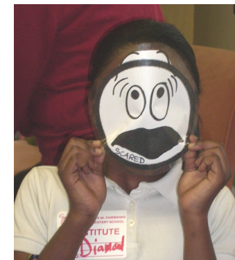
Exploring emotions @PLC

“Of course I would recommend this program! The problems addressed are common problems throughout every school- everywhere! Problems and conflicts are the major causes for classroom disruptions; thus, taking away precious minutes of any instructional and learning time. Anytime a class/school/community can gain extra support on conflict resolution strategies, improvement all around will be the outcome.” – Center for Inquiry teacher