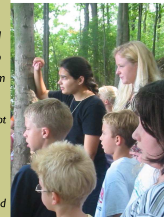
Programs at Eagle Creek Park feature nature walks where the center is surrounded by miles of woods and water.