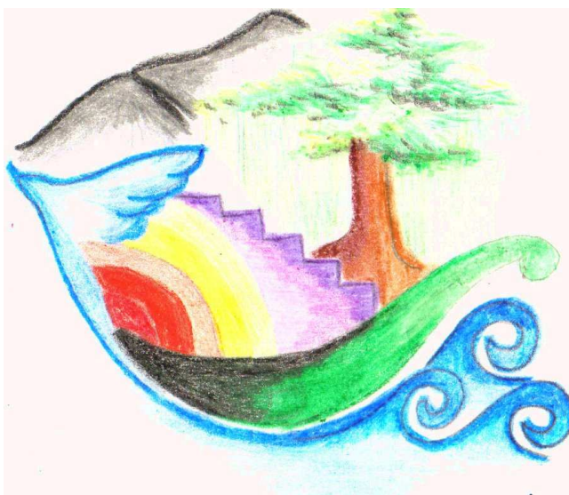
Artwork by a student from the Philippines who spent three-days at PLC with fifty other Christian and Muslim youth from Mindanao—a place that suffers from interfaith struggles with Al Qaeda.