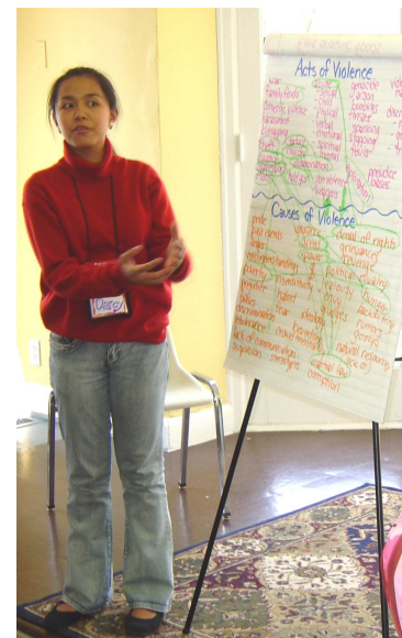
A youth facilitator explores the root causes of violence