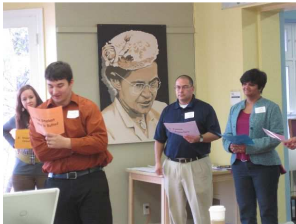
Participants in a Tuesday's at PLC session enacting a role play

Two years ago, Peace Learning Center launched our new Corporate and Community Program that offers professional development focused on cultivating healthy organizational practices. So far, more than 280 local and national businesses and community organizations have participated. Tuesdays at PLC is a series of monthly workshops that are short learning sessions. Professional Development Sessions included half-day and custom designed learning experiences outlined below.