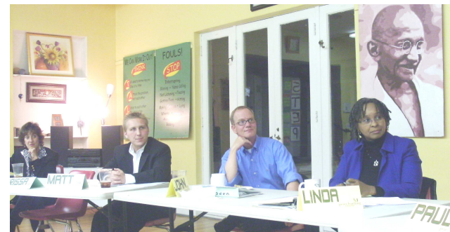
Board members participate by promoting and connecting Peace Learning Center to the community